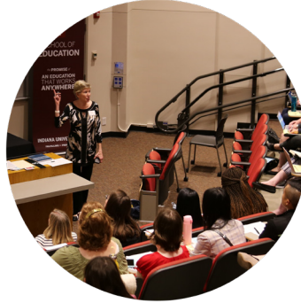
I Can Persist