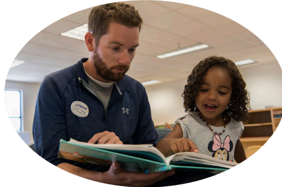
Employee Resource Groups