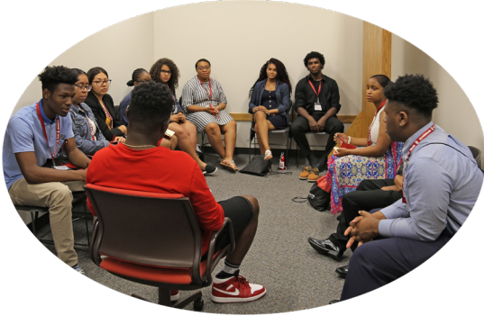
Balfour Scholars Program