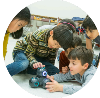
Make, Innovate, Learn Lab Makerspace