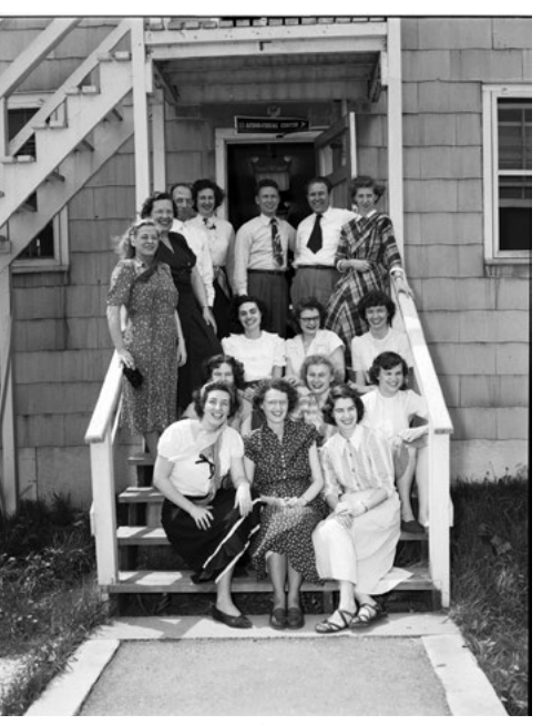
Audio Visual Center going away party, May 1950

identify best ways to treat to content. We presented a proposed treatment and then, after approval, would work on scene-by-scene scripting."