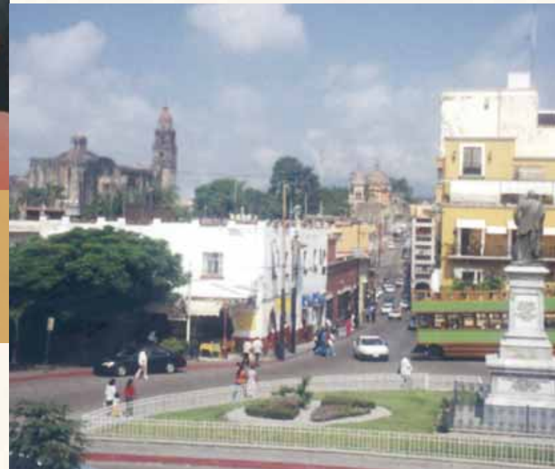
Considered the language capital of Mexico, Cuernavaca, Morelos, is the location of IUPUI's To Mexico With Love program.