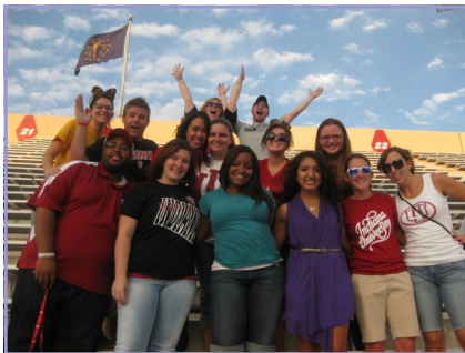
HESA students celebrate the first IU home game