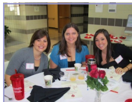
Current 1st & 2nd year HESA master's students

The theme of the event was Celebrating HESA Through the Decades and throughout the program information was shared about how the program and the field of student affairs has changed and evolved over the last four decades. This information was compiled