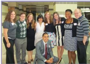
2010 IUSPA Executive Board

On Sunday, October 17, 2010, IUSPA (Indiana University Student Personnel Association) hosted an alumni brunch to celebrate IUSPA's 40 th Birthday and the organization's founding in 1970. Since it began, IUSPA has been a part of every master's student's