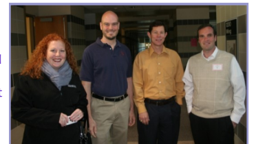
A group of the HESA alumni at the event