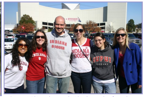
Current HESA students and HESA alum gather for a photo